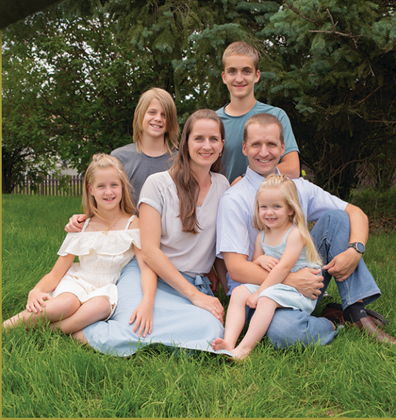
THE KUHN FAMILY